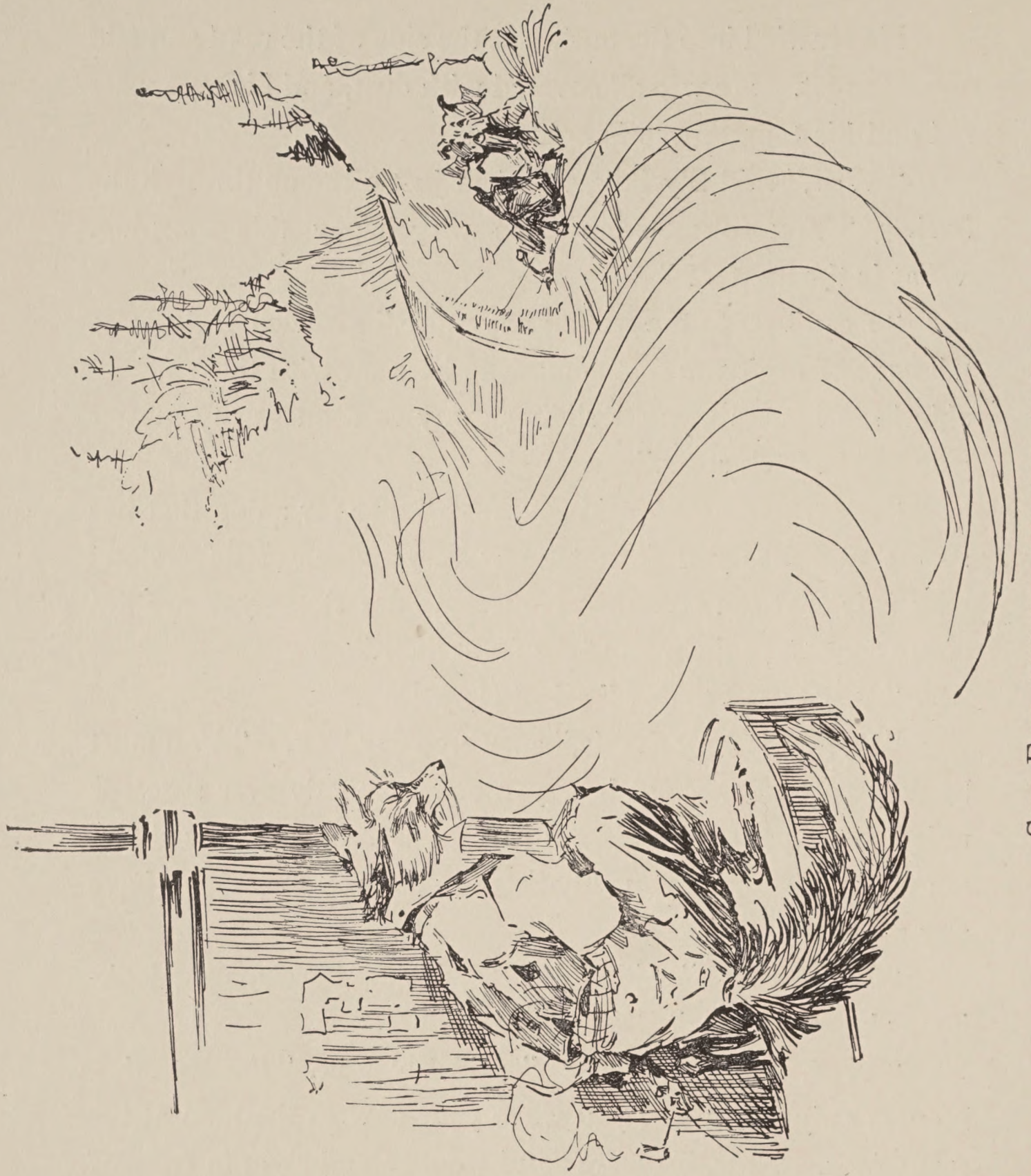
SLY FOX ESCAPES ON THE CAR.